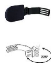
Swing away medium