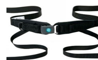
4-point hip belt