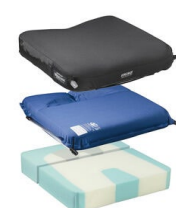
Varilite Meridian™ PSV

Dual-chambered, adjustable skin protection cushion. Ideal for prevention of sacral sitting