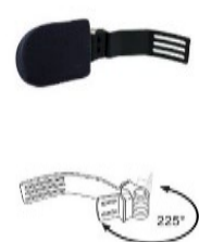
Swing away short