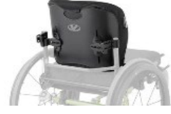
Icon™ Back System Mid

Combines innovative VariLock™ hardware with a sleek, low profile look