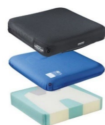
Varilite Evolution™ PSV

For wheelchair users with a high degree of tissue breakdown and symmetric positioning needs.