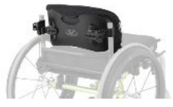
Icon™ Back System Low

Combines innovative VariLock™ hardware with a sleek, low profile look