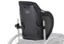
Icon™ Back System Deep

Well suited for users needing additional support or with a tilt-recline system