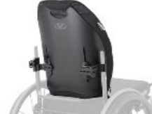
Icon™ Back System Tall

Provides support and positioning to improve trunk control and decrease fatigue