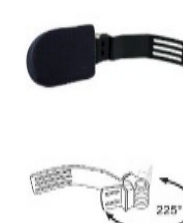
Swing away long