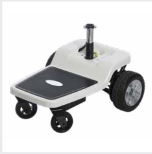
500 mm turning radius