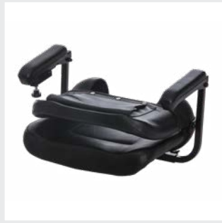
Dismantles into three parts