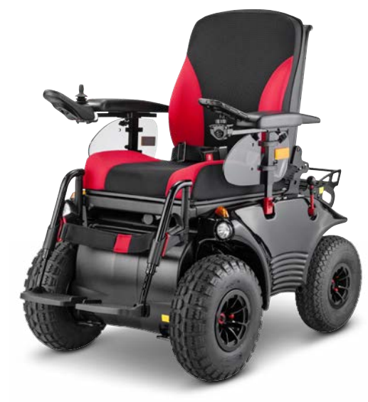
Optimus 2 incl. RS Edition (CODE 2201)