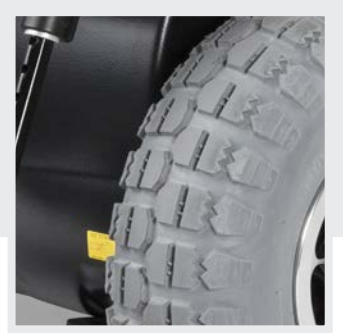
Excellent traction and off-road capability