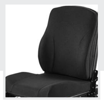
Optimal sitting comfort – optimal adaptability