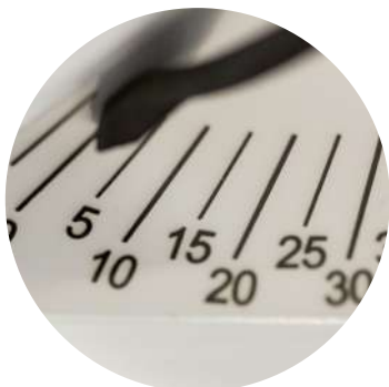
EASY HANDLING OF TILT WITH READABLE ADJUSTMENT

Easy to operate - intuitive handles and functions