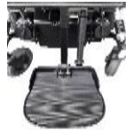
81017 Footplate flip-up electric